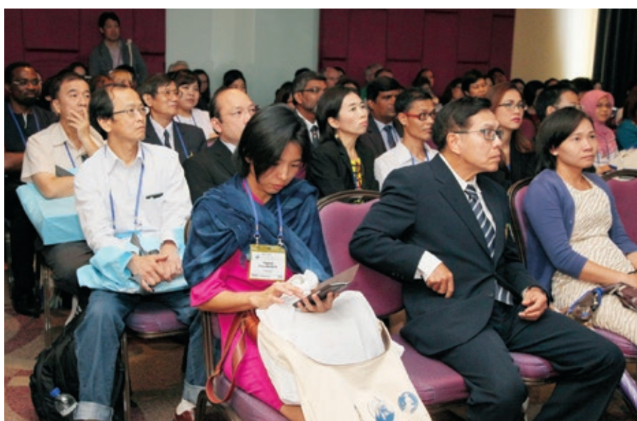
ISDS Sessions at WCS 2015 Bangkok