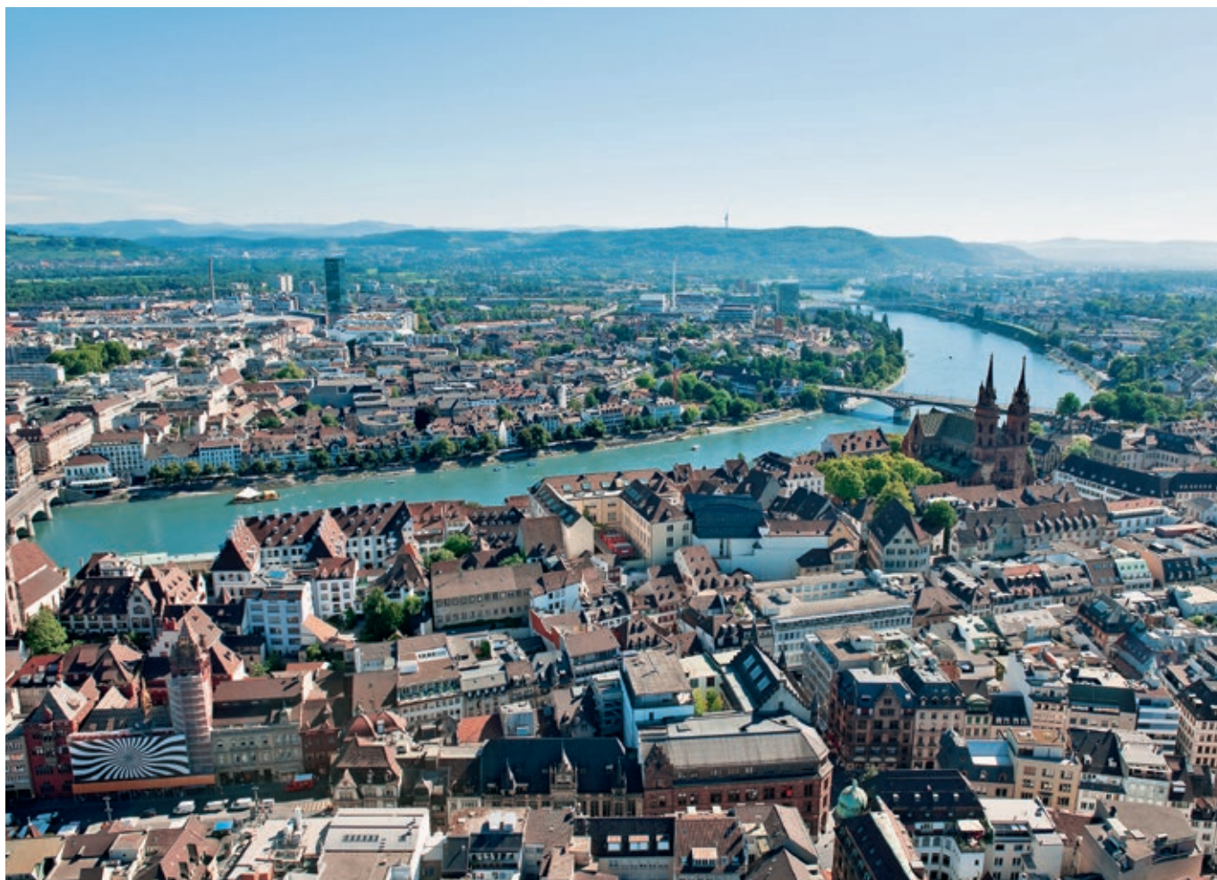
The City of Basel from a bird's eye view

2011. His experience will help tremendously during these difficult times.