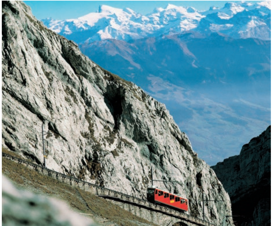
Pilatus (2120 m), panoramic summit in Central Switzerland. From Alpnachstad reachable by cog-wheel railway.