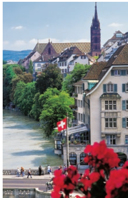
Waterfront Basel