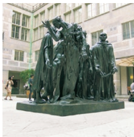
Art Museum, Basel