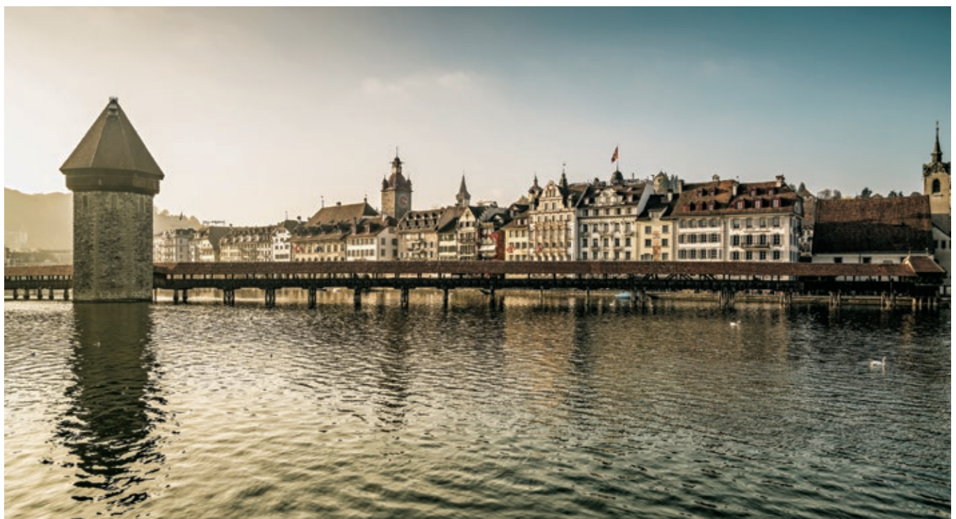
Evening in Lucerne with the internationally renown Chapel Bridge. Just 1:15 hrs from Basel