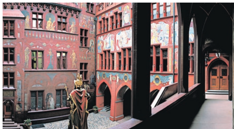
and inside