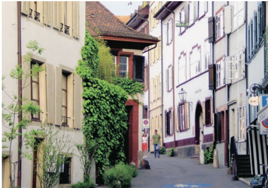
A lane in the Old City of Basel