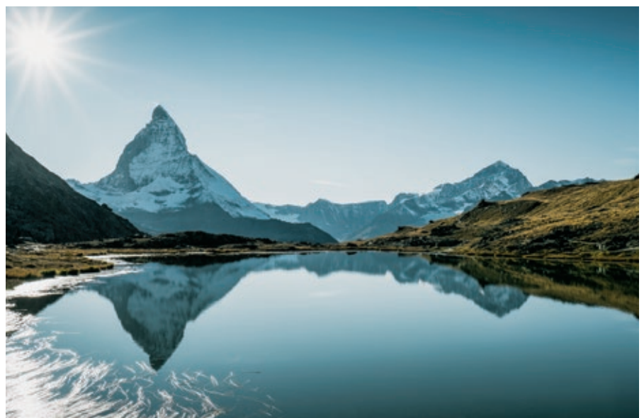
Evening view from the Riffel lake to the Matterhorn

be held at Basel in 2017 and this promises to be an exciting meeting.