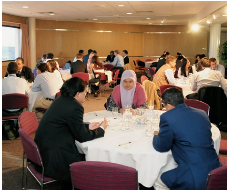
WJS Writers' Workshop at WCS 2015 Bangkok

This year the Journal is evolving our electronic transformation. For many years we