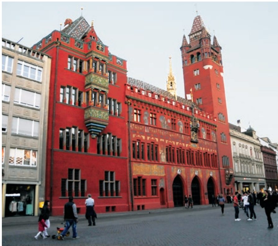
Basel City Hall outside

and constructive feedback not only to those manuscripts generated from our meeting, but for your ongoing help and support throughout the year. Thirty of the podium presentations were accepted by the World Journal of Surgery and will be included in the IAES issue of the journal in the near future. If you haven't received a request to review an endocrine surgical manuscript for the WJS and would like to do so, please let us know and we will be sure to find you some work!