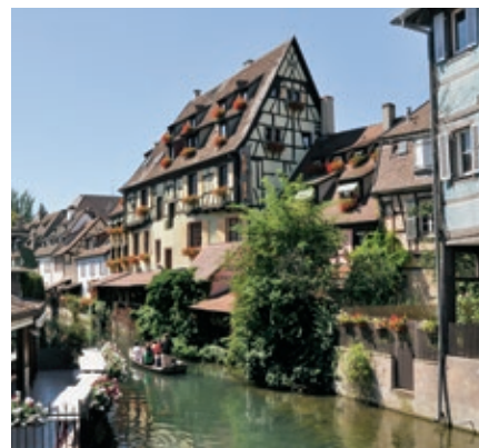
Colmar, France – 50 min. from Basel