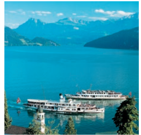
Lake Lucerne in Central Switzerland