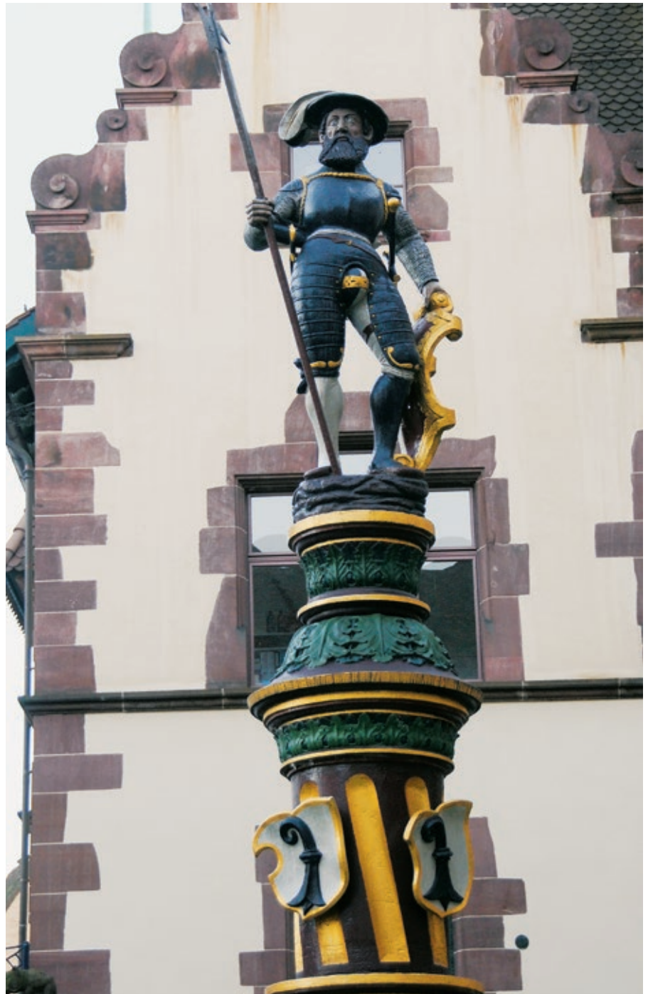
Sculpture on a fountain at historic city center, Basel