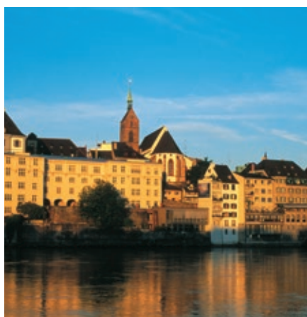
Old University of Basel

Paper manufactory and printing were established in Basel and attracted scholars,