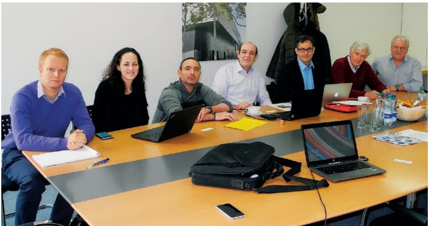
LOC, ISS/SIC and MCI-staff at site inspection