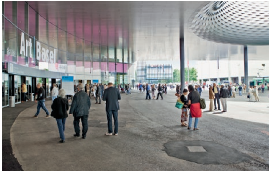
Basel Convention Center

Corner”. Have breakfast in Switzerland, lunch in Germany and dinner in France! And within 1.5 and 2.5 hours you reach marvelous places like Lucerne, Interlaken, the alps with the Matterhorn or the Mont-blanc, the highest alpine peak in Europe. Besides its attractive medieval old town center Basel is also the “birthplace” of