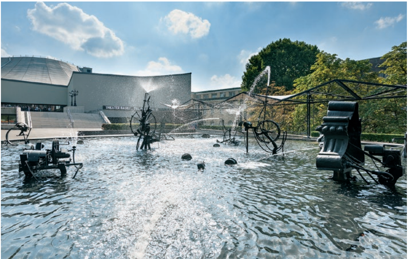
Fountain in Basel by artist Jean Tinguely