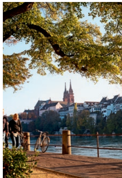
Rhine River in Basel with the "Muenster"

Now is the time to mark your participation at this congress in your diary and take advantage of travelling from far to visit friends in Europe and explore most attractive sites in and around Switzerland. Your family will appreciate joining you.