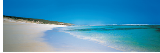
Miles and miles of beautiful beaches

Adelaide was known as the city of churches but in reality it has significantly more pubs. It has a well deserved reputation for fine living and is the home of internationally renowned artistic activities such as the Adelaide Festival of Arts, The Festival of Ideas and WomAdelaide. Restaurants are world class with an emphasis on quality wine which is locally grown as 60% of Australian wine comes from this area. Adelaide in September is still quite cool as spring will have just arrived and blossom will still be on the trees. You can expect clear sunny days with a maximum temperature around 20°C although as it is close to the equinox it can be windy. Therefore all events will be based indoors at the Convention Centre but with access to the river and environs.