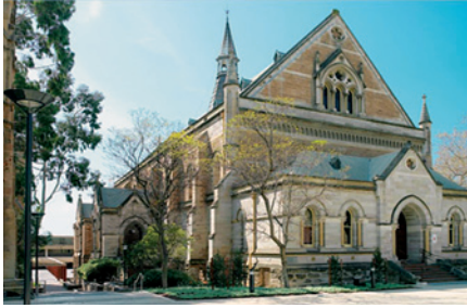
North Terrace. The Elder Conservatorium of Music, University of Adelaide