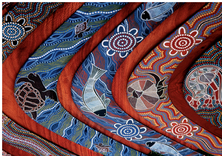
Traditional Aboriginal Boomerangs