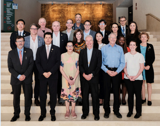
ISS/SIC Council Members 2024 - 2026 & Guests

ISW2026 Mexico was jointly organized by ISS/SIC and AMCE during a period of significant global uncertainty, including geopolitical tensions, evolving visa regulations, and international travel disruptions affecting participants from multiple regions.